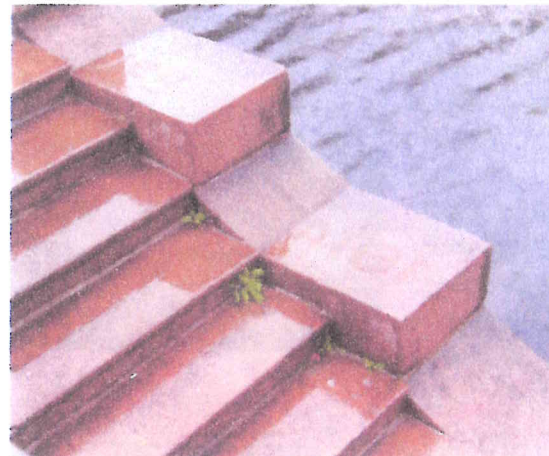
Top: Tommi Grönlund and Petteri Nisunen, Unnaturally Natural